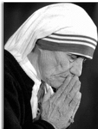
Mother Teresa Founder, Missionaries of Charity